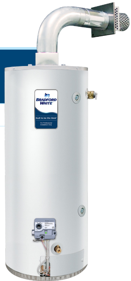
Photo is of RG2DV50H6N