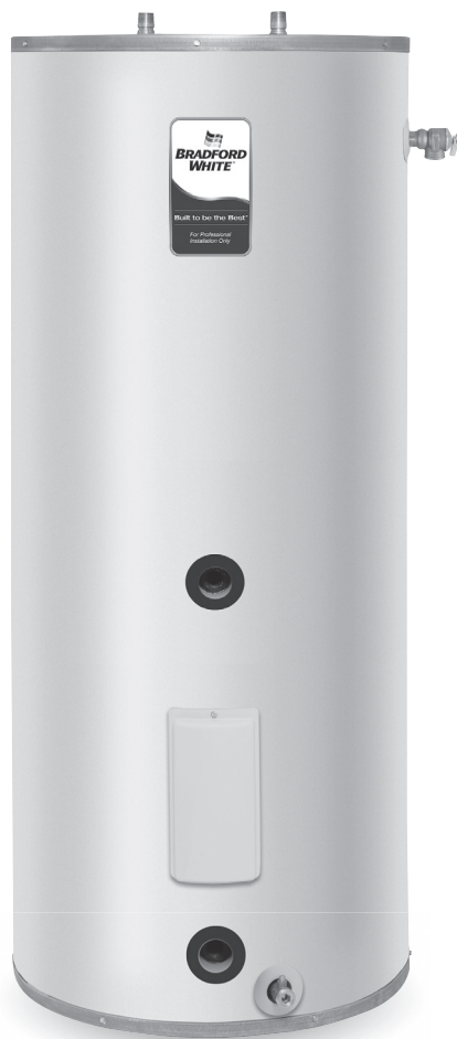
Photo is of DW-2-50-L